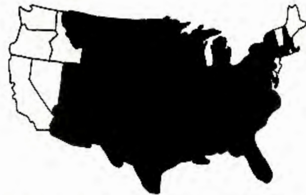
The darkened portions of this map represent the 38 states that have been heard during the sunset period in Chicago.

The beginner may enjoy satisfactory results with a good portable receiver and an up-to-date domestic log. The more experienced listener may prefer a communications receiver and loop, sunrise/sunset maps (essential for serious listening) and a good road atlas. Other aids include maps that show the location of stations, such as the Golden West frequency maps or the SRES Spot Radio publications. If conditions are good to a particular area or even a single city, you may have only a few minutes to check for likely target stations before they are scheduled to sign-off.