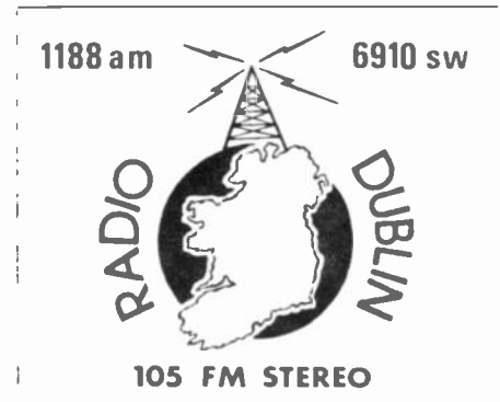
The Voice of Ireland on Short Wave

As you might expect, location of the transmitter and receiver sites makes a big difference with if the signal is heard. For example, anyone further west than Western Pennsylvania will have a difficult time logging Europirates on 48 meters (although these stations have been heard into the Midwest). The further East your location is, the better the signal will be. For example, DXers in the