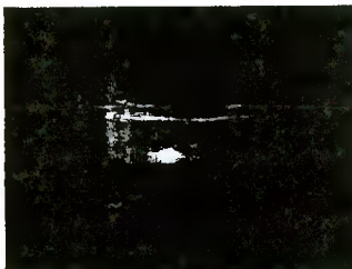
Sunset at KJES radio station in Yado, New Mexico