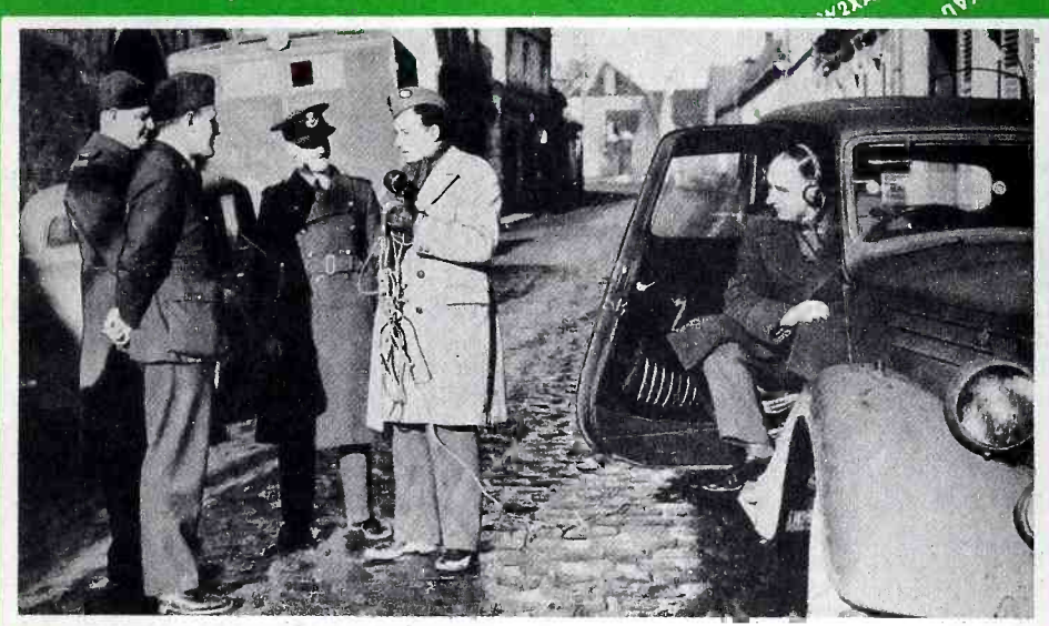
Pick-up by Short-Wave of an Interview with Pilots of the British Royal Air Force, from Somewhere Near the Front Lines in France.