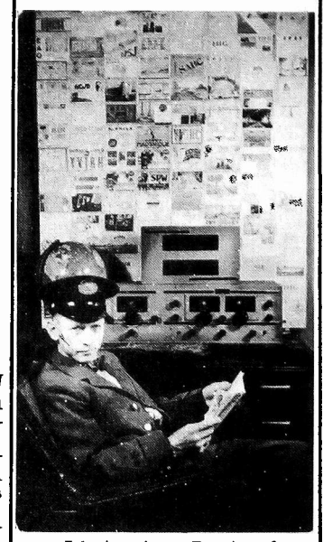
Listening Post of

The 4 mobile motor units in the Lawrence Thaw trans-Asiatic expedition will be able to maintain contact with each other even when separated by distances as great as 200 miles. The equipment will permit short-distance transmission and reception between each of the two trucks, trailer & cruiser sedan by the use of 4 UHF xmtrs. and communication type receivers. 2 medium-high freq. xmtrs. & re-