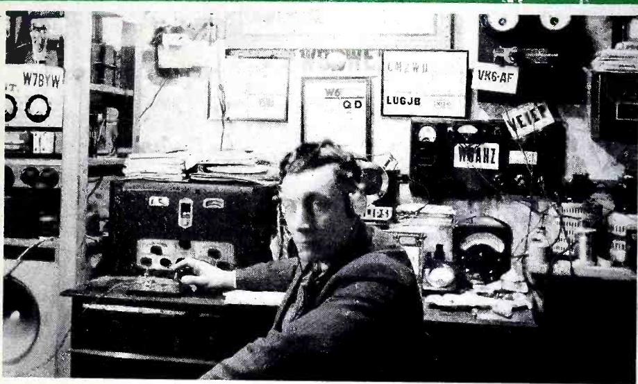
AMATEUR STATION ZBIH, IN MALTA