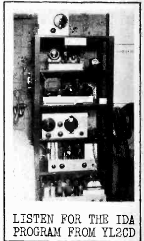
LISTEN FOR THE IDA PROGRAM FROM YL2CD