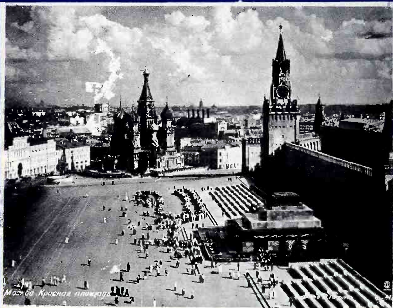
The Famous Red Square in Moscow, As Pictured On the Latest Verifications from RKI