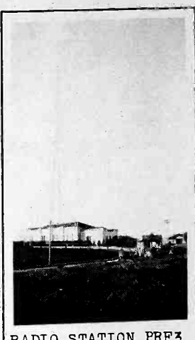
RADIO STATION PRF3 S. PAULO, BRAZIL

Have you heard HIT (1050kC), Trujillo City, D. R. ? Has power of 50w.