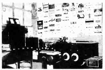
THE EXCELLENT DX CORNER OF BILL WARNER, EXETER, ENGLAND