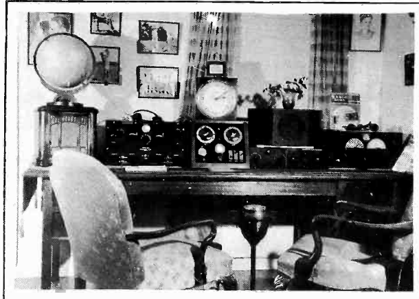
ELABORATE LISTENING POST OF C.L.EGGENWEILER. | FINE DX CORNER OF CHARLIE OF LOS ANGELES. (Note Super-Pro and RME-69)