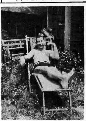
Murray Buitekant Black Sheep of Beta Chp Brooklyn, New York