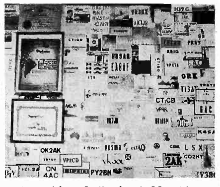
Exceptional Veri' Collection-Raymond C. Messer, South Portland, Maine.