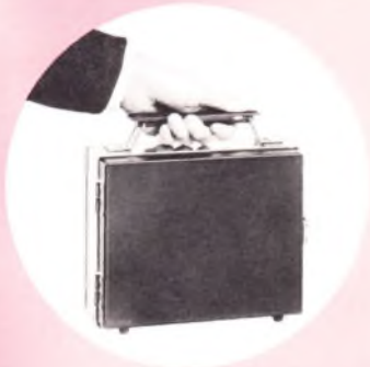
IN ALL NEW HI-STYLED CARRYING CASE

The Mighty Mite is always at the top of the list in tube tester sales. Here is the newest of all Mighty Mites and newest of all tube testers.