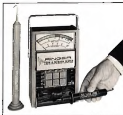
Accessory 10KV Probe for Focus Voltage measurements with 50KV Adapter for 2nd Anode voltage checks.

Ringing Test: Dynamic test counts the number of cycles a coil rings before reaching 25% damped level after 15 VP-P exciting pulse has been applied. Meter is calibrated to give GOOD reading for 10 or more cycles detected before 25% damped level, for yokes and flybacks presently in use. Sensitivity is adjustable for coils other than yokes and flybacks.