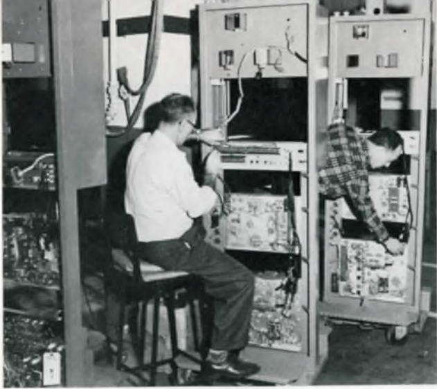
FACTORY PERSONNEL assembling Model CLR-6 microwave equipments at Plant 18.

El Paso Natural Gas Company, Bonneville Power Administration, Humble Pipe Line Company, Great Lakes Pipe Line Company, Platte Pipe Line Company. Add to this list the American Telephone and Telegraph Company and its affiliated Bell System and the United States Air Force as large and discriminating customers who use Philco microwave equipment as integral parts of America's world-wide military and commercial communications networks.