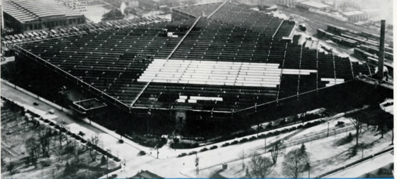
PHILCO PLANT 50, headquarters for G. and I. Division, 4700 Wissahickon Avenue.