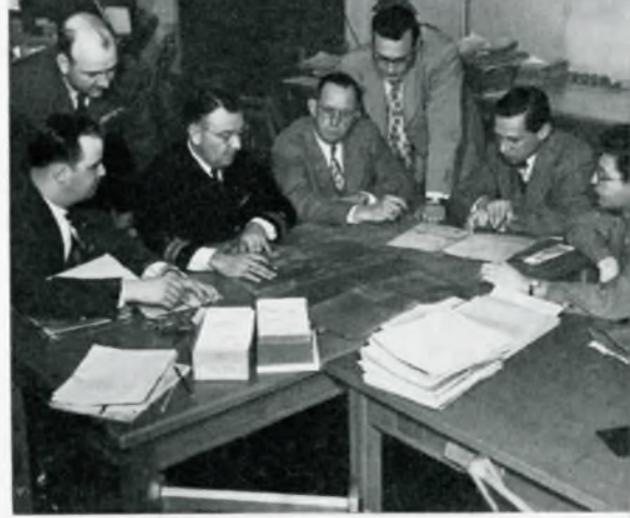
SOURCE CODING —In this step, Navy personnel determine whether an item should be manufactured by the Navy or procured from Philco.