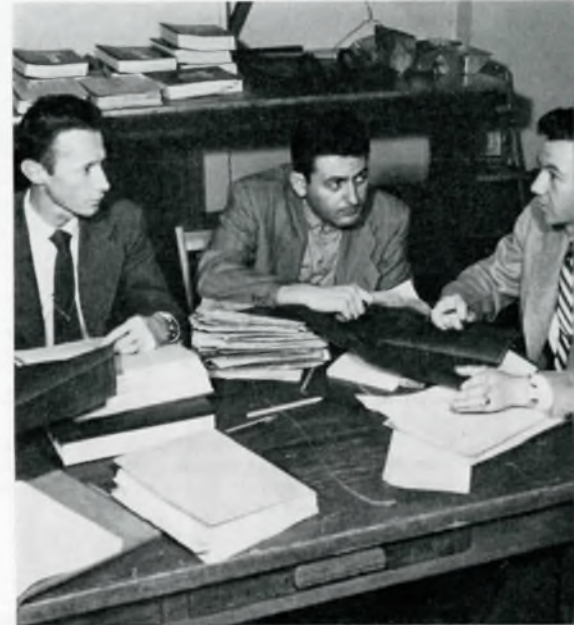
EACH DRAWING must be checked for complete engineering information in order to stock number items coded "purchase." Another step shown in this photograph is the recording of the source code of the Philco drawing shown which is then forwarded to ASO.