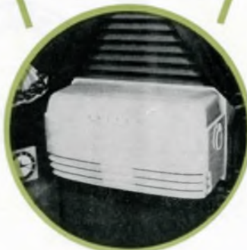
FOR THE HOME

With this wide range of models and features, there is no reason for anyone to settle for anything less than a Philco.