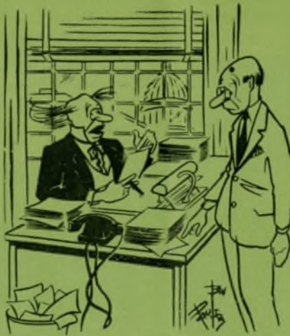
"I'm afraid you'll never make a good bureaucrat, Higgins. You use too many plain words!"