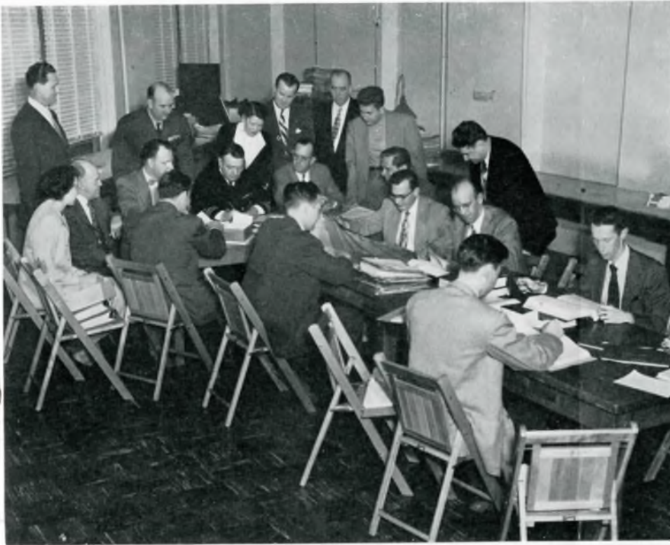
AN OVER-ALL SHOT OF THE TEAM —In this photograph, from left to right around the tables, the man with the card file is symbolizing Philco drawings from Philco records. The next larger group is occupied with source coding. The third group is working on a maintenance allowance list. The fourth group at the extreme right is recording source code and table replacement parts.