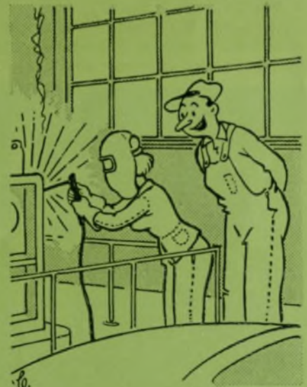
"Did anyone ever tell you you're beautiful?"