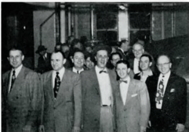
MEMBERS OF THE SUPERVISORS' CLUB arriving for an inspection of operations at the Scheidt Brewery in Norristown. The inspection trip was arranged as part of the monthly meeting of the Club.