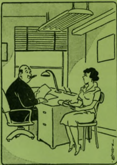
"Would you mind repeating the last two pages?"

During the month of April alone, it showed the rest of the Nation such Philadelphia features as the work of the Emergency Rescue Squad; how Independence Hall is protected from fire; a visit to the nursery at the Pennsylvania Hospital's Women's Building (Lying-In Hospital); and election news round-ups. All the network feeds were remote telecasts direct from the scene of the activity. Numerous other special-event originations are planned for showing on the "Today" show.