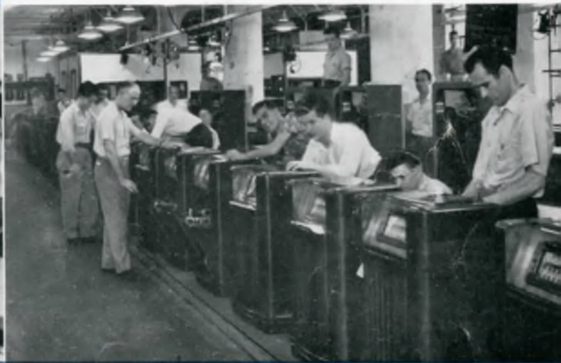
6 MOUNTING OF LARGE RADIO-PHONOGRAPHS