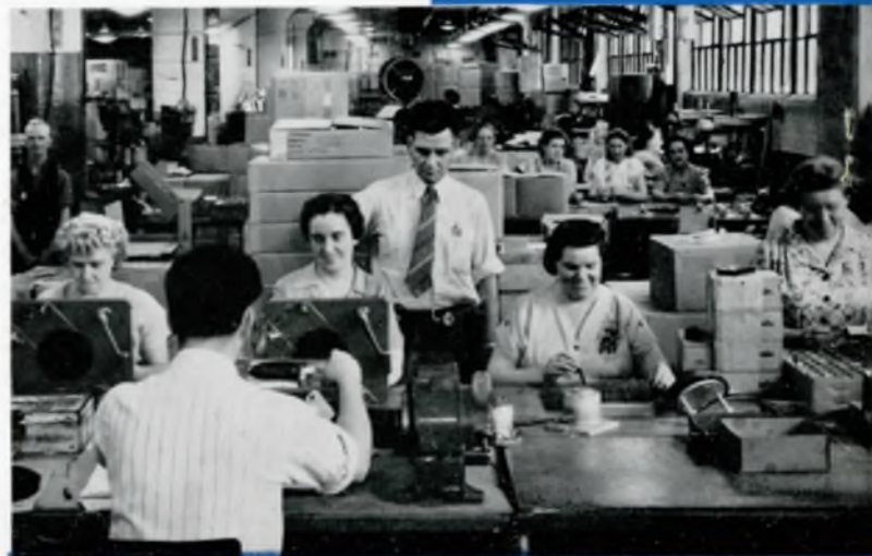
INCOMING INSPECTION DEPARTMENT.