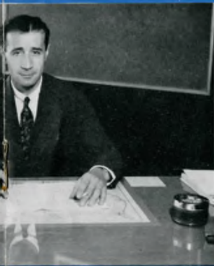
of the radio division, Philadelphia Philco ents.

so that each radio set will give the best performance.