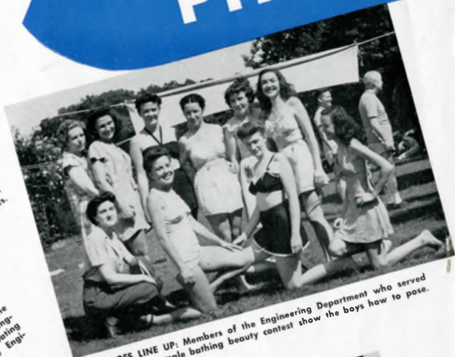
THE JUDGES LINE UP: Members of the Engineering Department who served as judges for the male bathing beauty contest show the boys how to pose.