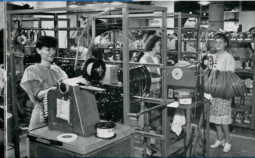
2 LOOP WINDING

It is interesting to note that the Philco straight-line production system requires no extensive warehouse facilities. Components flow into the plant, and finished radio receivers and radio-phonographs flow out directly into waiting freight cars or trucks. Thus the production department achieves the highest mass-production efficiency, no floor space is wasted, and the radios for which America is waiting reach the consumer in the shortest time.