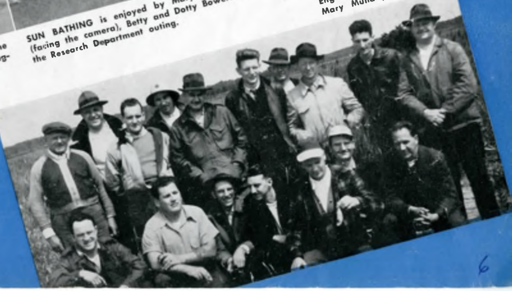
THE FISH THAT DIDN'T GET AWAY is photographed with members of the Test Engineering group of Dept. 20 who recently went on a fishing trip to Fortescue, N. J.