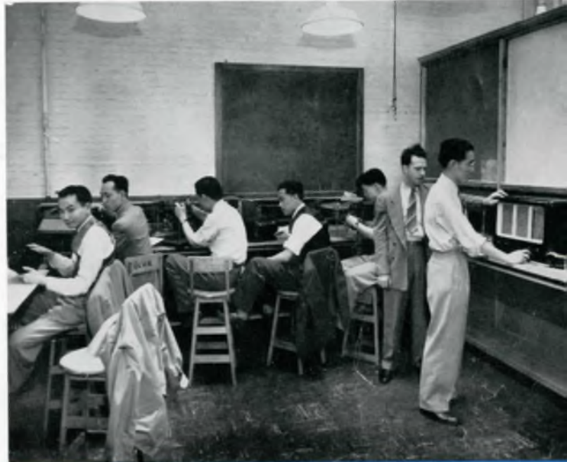
Six Chinese radio engineers, all with Master of Science degrees, representing Central Radio Manufacturing Works, Shanghai, China, one of the leading export distributors of Philco products, take an intensive course in servicing Philco appliances at one of the Company's Philadelphia plants.

"Shortly after completing their specialized course in Philco servicing methods, the six engineers will return to China. There they will travel all over the country to instruct dealers and dealers' service men in the correct procedures for installing, maintaining and repairing appliances manufactured by Philco."