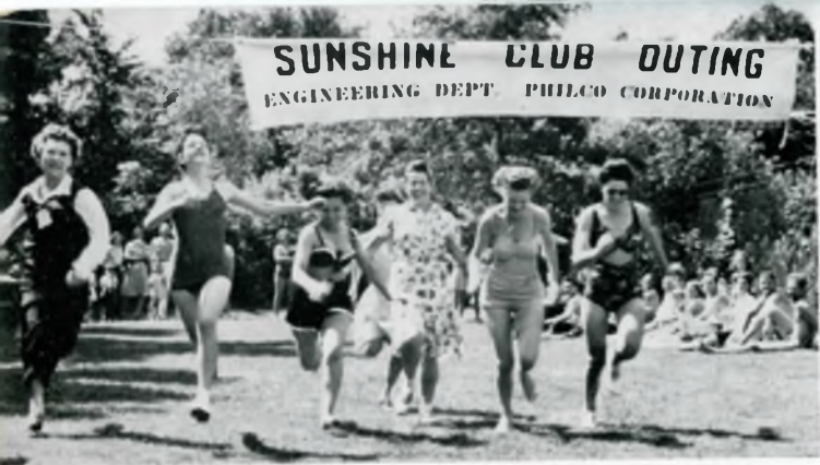
NO RACING RECORDS were broken but a great deal of fun was reported by the girls at the Engineering Department outing at Somerton Springs.