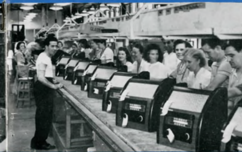
5 CABINET MOUNTING ON TABLE RADIO-PHONOGRAPHS