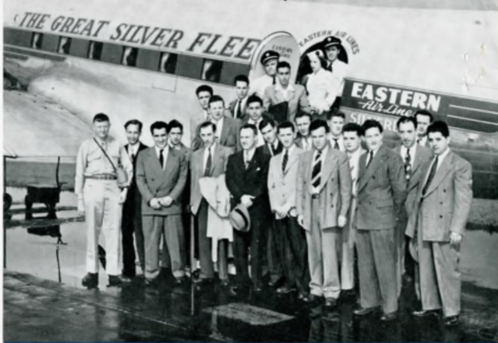
PHILCO ENGINEERS FLY to Florida to attend a special radar school. Twenty-one radar engineers of the Company are shown beside the Silverliner plane of Eastern Air Lines on their arrival at Orlando, Fla., from Philadelphia en route to attend a special radar school at Boca Raton, Fla. After completing their course the engineers will be assigned to foreign service.

In no other division does the teamwork of all divisions show up so clearly as it does in the radio manufacturing division. The story of production is, for this reason, one we urge you to read carefully. Successful production is the lifeblood of the Corporation: help keep it flowing in ever-increasing volume.