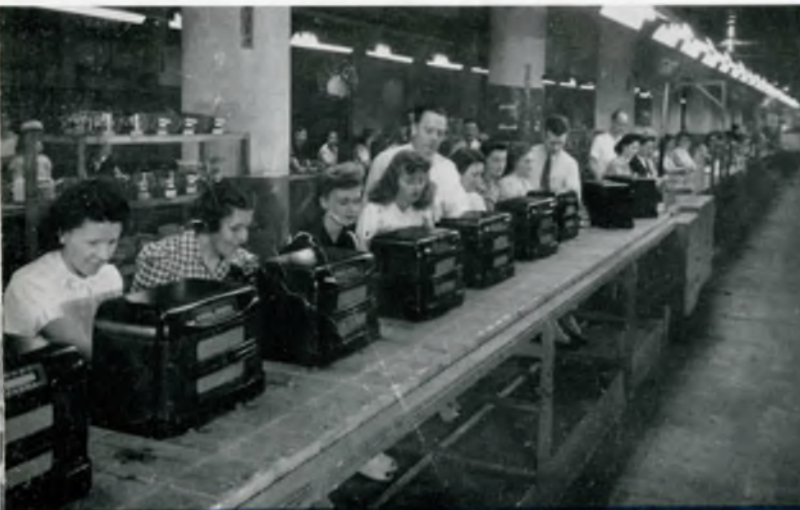
FARM BATTERY MODELS ON PRODUCTION LINE