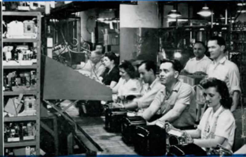
TESTING PT MODELS