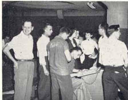
Who won? Who was the Clark Gable character posing for the photographer?

The Lucky Strikers, Scatterpins and Pin Heads won the honors on high three games rolled, while the Pin Heads, Scatterpins and Go-Go-Go's