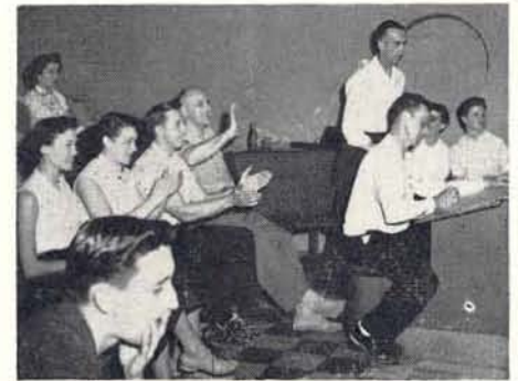
Who got the sloppy hit?

en dinner to close out their season when they gathered at Turner's Hall on May 9. Of course there are bowling lanes available there, so probably