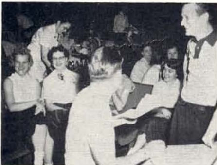
Everybody smiling for the photographer.