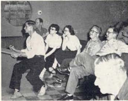
Is it a hit or a miss?

The bowling season has drawn to a close and once again all bowling participants report having a successful season. Naturally it was more successful for some than others.