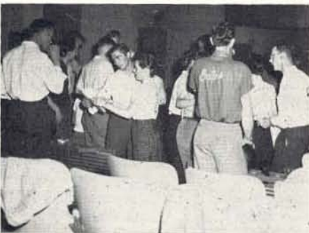
Everybody checking scores, getting ready to move to the next alley.

Many are hanging up their bowling shoes for the summer and are putting their bowling ball in the trunk of the car to roll for the summer season.