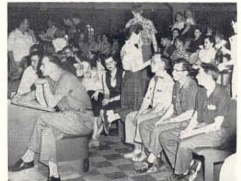
Why so glum folks . . . didn't anyone have a good game?

en dinner to close out their season when they gathered at Turner's Hall on May 9. Of course there are bowling lanes available there, so probably