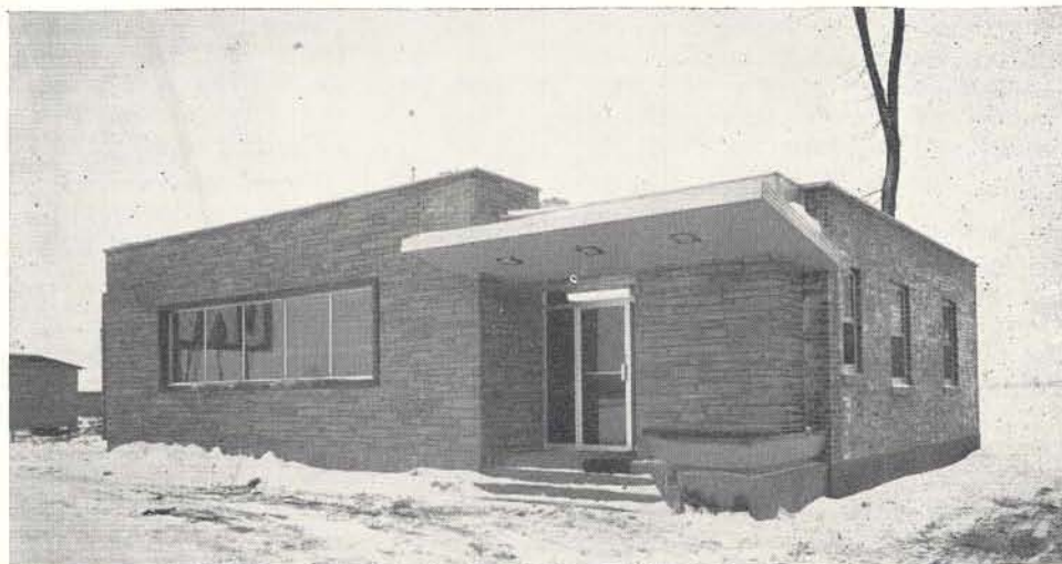
New CKVL transmitter building located on Highway 96 outside Montreal, is shown above. This building contains two Gates BC-10B transmitters and all other equipment required for 24-hour a day operation.