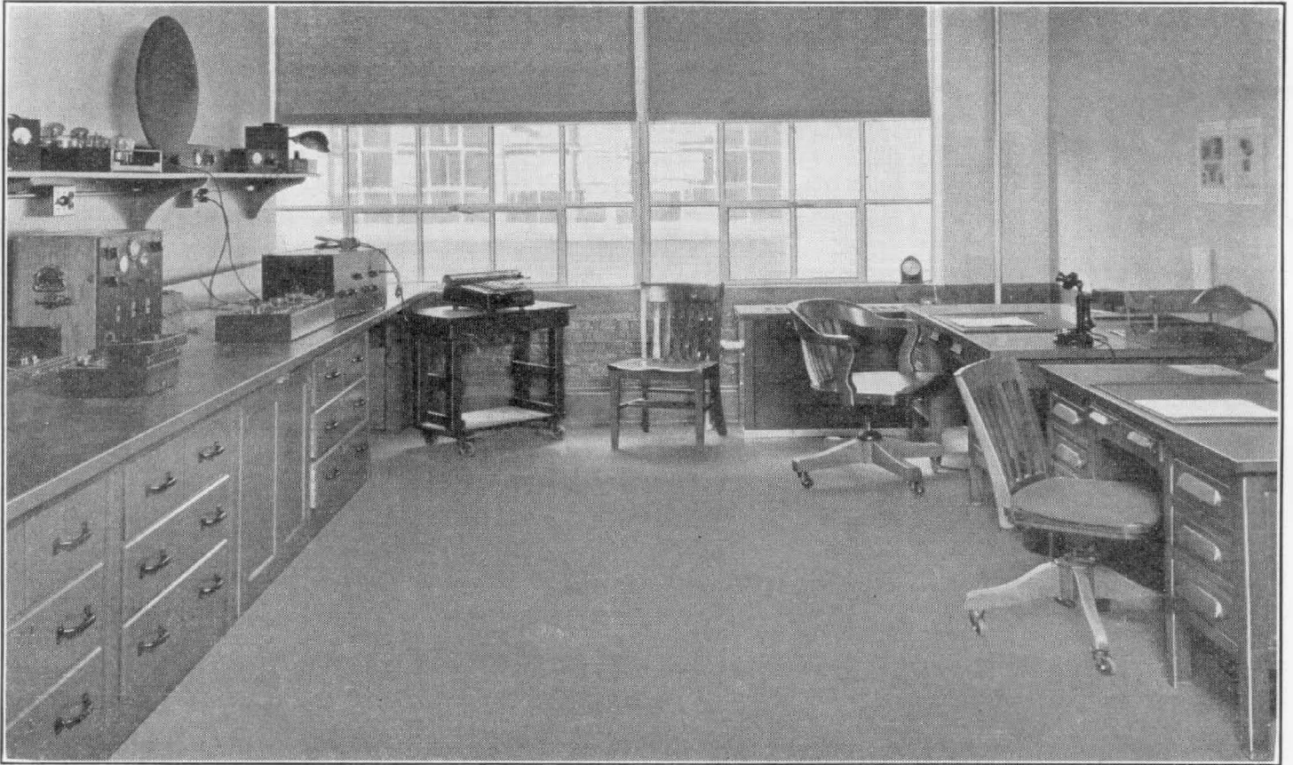
FIGURE 2. A typical laboratory. It will be noted that the power outlets are so located that they may be used conveniently for apparatus on the bench or on the shelf. Each outlet has its own switch and pilot lamp

unit being added to the General Radio plant. The primary purpose of this new building was to provide suitable space for the engineering department which, due to its growth during the last two years, was finding its previous quarters somewhat crowded.