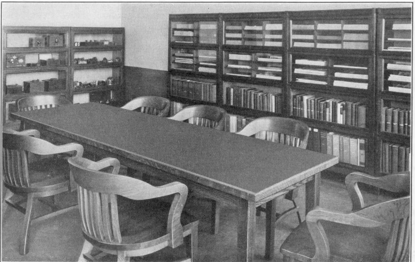
FIGURE 5. The engineering library. In addition to the usual library facilities this room provides space for the company's collection of historic apparatus. It also serves as a conference room for the Engineering Department

iently located to the laboratories. This shop is on the third floor of the new building unit. Figure 4 shows a general view of the arrangement of this division of the engineering department. As many of our readers know, the function of this experimental shop is primarily to facilitate the construction of apparatus needed by the engineers. Experience has shown that it is highly desirable to separate this shop from the regular production units, thus freeing the workmen from any contact with routine production schedules. The men employed in this shop have had long experience in this highly specialized type of work. The intimate contact thus possible between the engineer designing a piece of apparatus and mechanics familiar with the manufacturing processes is of inestimable value.