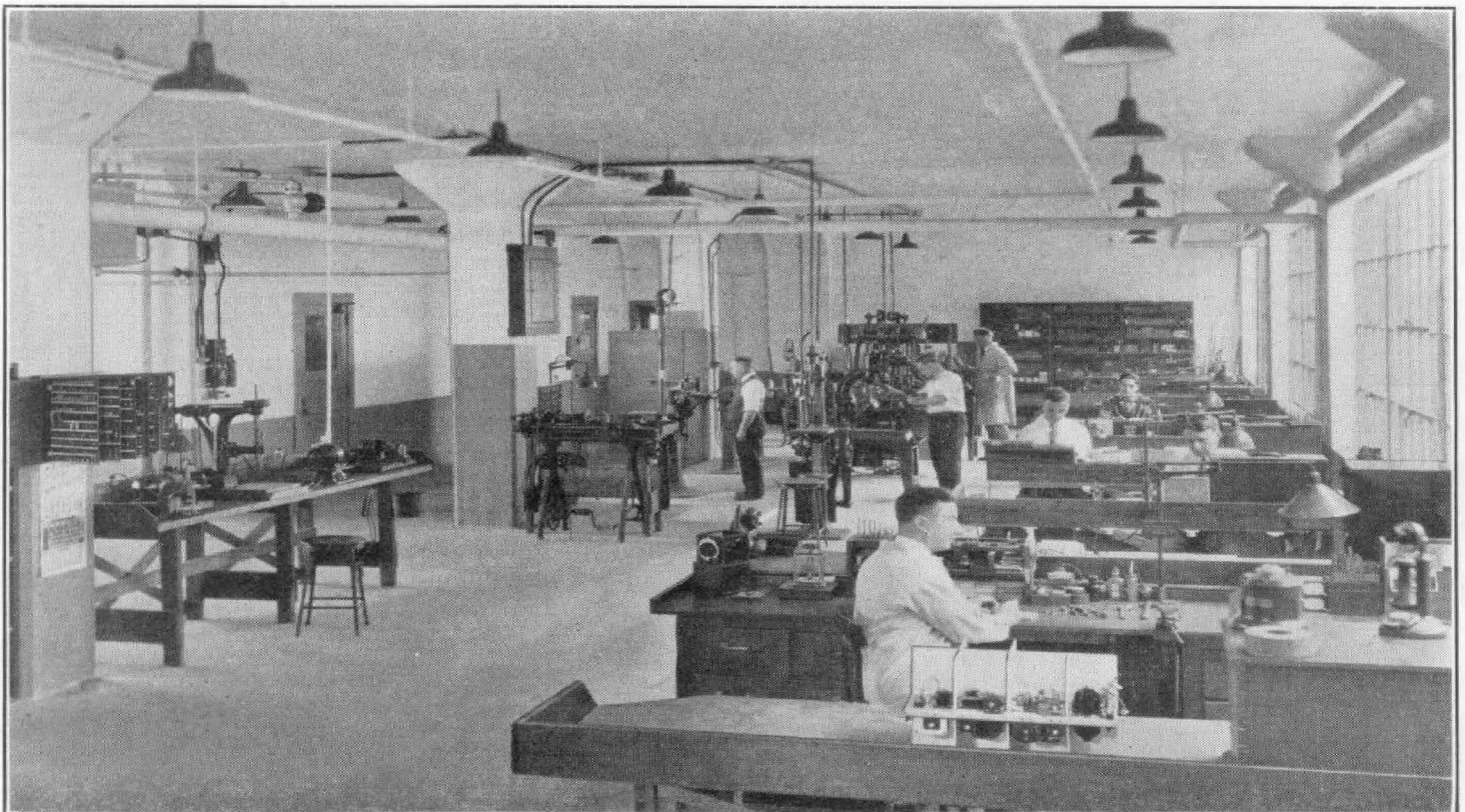
FIGURE 4. The experimental shop. A variety of machine tools are available so that the shop may promptly supply the needs of the most enthusiastic experimenter

The apparatus continuously available in the standards laboratory is