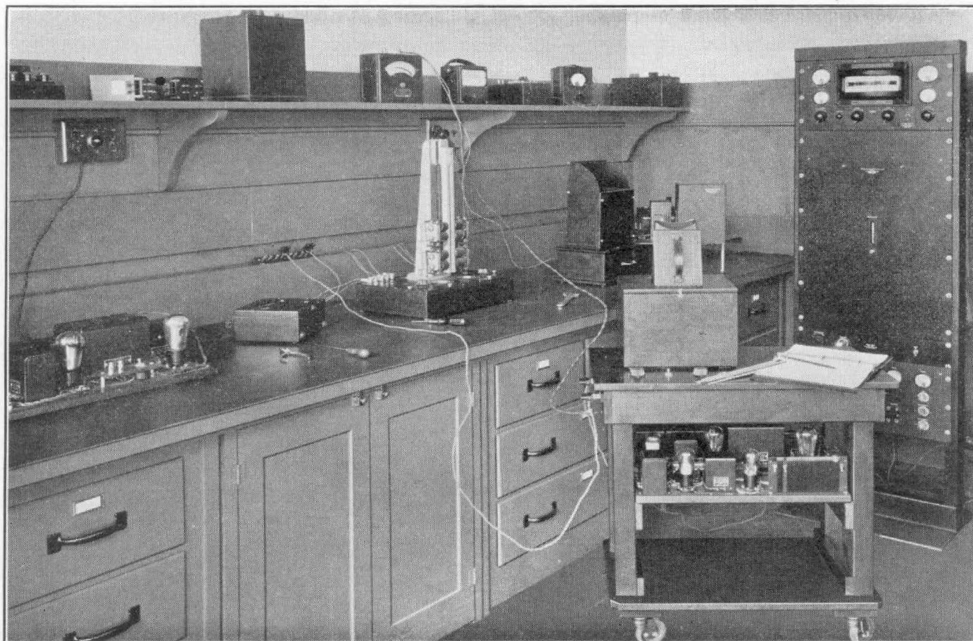
FIGURE 3. A laboratory set-up. A study is being made of the performance of a number of tube-driven tuning forks. The relay-rack panel includes a constant-temperature container for housing a precision fork. A stroboscope accurately comparing two frequencies is shown in the foreground

The shelf shown above the laboratory bench is planned to carry apparatus accessory to that on the bench proper. It is particularly convenient for the