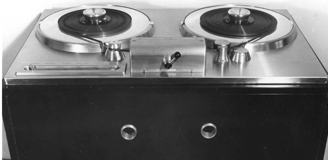
Fig. 4. Model 200A.

Ampex delivered the first production Model 200A in April, 1948, to Jack Mullin; the second recorder followed a few days later. Jack used serial numbers 1 and 2 for recording the Bing Crosby Show. Many of the rest of the first production run of 20 went to ABC in Chicago where they were used mainly for broadcast time delay. This was a revolutionary change for the