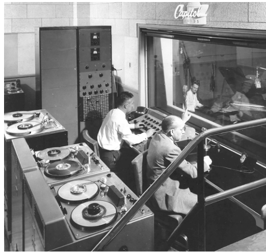
Fig. 6. Models 201 and 300 in use at Capitol Records.

By early 1949, the financial situation for Ampex had improved considerably as a result of shipments of the Model 200A and Model 201 conversion kits. Alex was now able to do something he had wanted to do for some time: hire Walter Selsted.