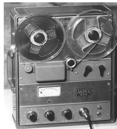
Fig. 8. Model 600.

The same year, Jack Wernli started development of the Model 600 series of products that was eventually introduced in 1954. The 600 used 7-inch reels. It was both portable and light weight at only 27 pounds. At 7.5 ips, its recording/playback quality equaled that of the Model 400.