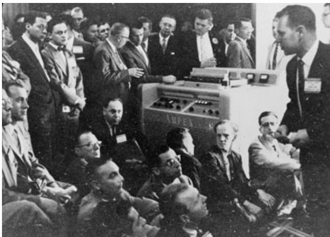
Fig. 10. Videotape recorder introduction, 1956, April 14.

When the Convention opened the following day, everyone had heard about the introduction of the Ampex videotape recorder at the CBS meeting, and Phil Gundy announced that