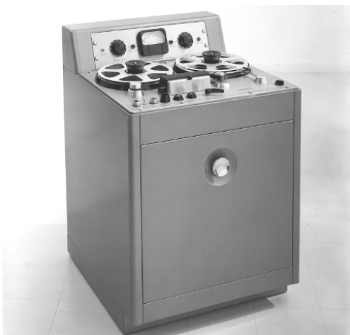
Fig. 5. Model 300.

For the Model 300, Harold did the mechanical part and Frank did all of the electronics, including the record/playback electronics.