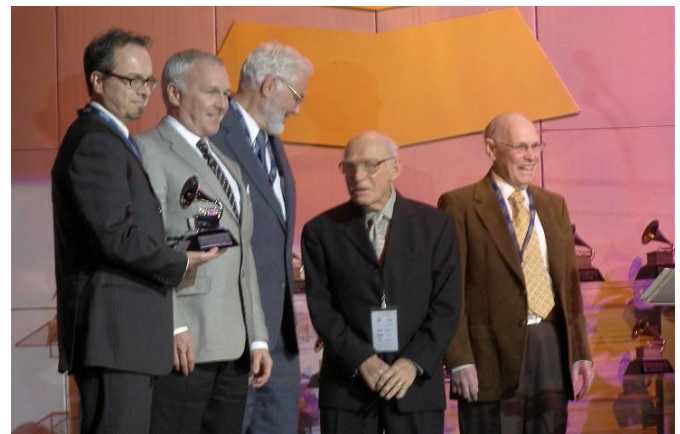
Fig. 13. Grammy award ceremony, 2008 February 9.