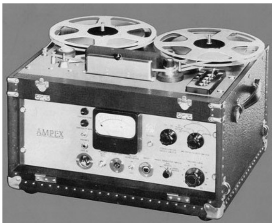
Fig. 7. Model 400A portable.