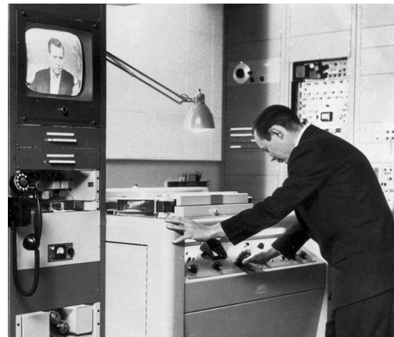
Fig. 11. CBS news anchor Douglas Edwards.