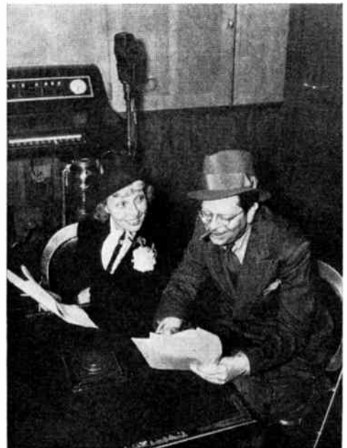
THE EASY ACES

Lennie Hayton, young ork-leader on the "Hit Parade" show, was at one time chief arranger for Paul Whiteman. The young maestro was also selected by "Pop" to conduct his excellent orchestra during broadcasts, and Lennie says it was about one of the biggest things that ever happened to him.