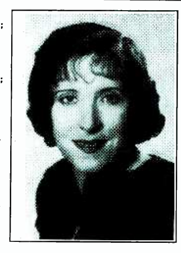
GRACIE ALLEN "Adventures of Gracie"-CBS

KLX—Clinic of the Air KROW—Diet and Health KJBS—Light Classics KGGC—At the Song Shop; 9:45, Star of Today KGDM—News & Styles KQW—Lite Classics: Book Review * KFRC & net—Eddie Dunstedter entertains; 9:45, Betty Crocker KHQ—Gems of Remembrance; 9:45, Rounduo Time KHQ—Gems of Remembrance; 9:45, Roundup Time KJR—News; Early Echoes KVI—Mystic Melodies to 9:45 KFI—Waikiklans; 9:45, News KNX—Magic Harmony; 9:45, News KGB—News to 9:35 KSL—Good Morning Judge KOA—National Farm & Home