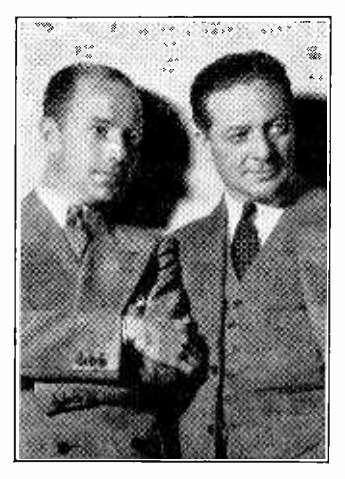
AMOS 'N' ANDY NBC-7 P.M.