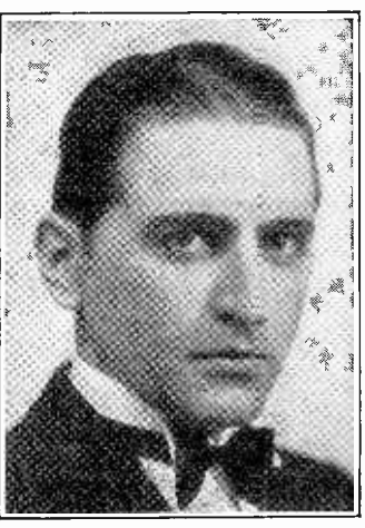
MEREDITH WILLSON KPO-8:15 P. M.