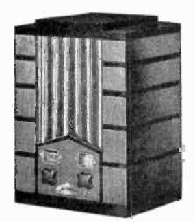
Studio MODEL 59 $44.50

5-tube receiver giving 8-tube performance, providing dual-range. 1st: 535 to 1550 K.C. 2nd: 1480 to 4400 K.C. Has automatic volume control, illuminated dial. Receives police, aircraft, amateur, commercial and marine calls as well as the regular broadcast band. Cabinet is of quarter-sliced birch with two-tone finishnatural and ebony, grill ornament is of highly polished aluminum. Dimensions: 13¾" high, 9½" wide, 7½" deep.