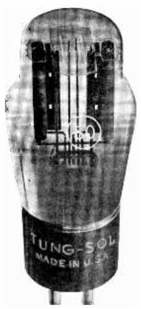
TUNG-SOL'S reputation as a precision manufacturer was established long before radio was born.

Look at the light bulbs in your automobile. They are probably Tung-Sols, because most of the cars in America have for years been initially equipped with Tung-Sol bulbs.