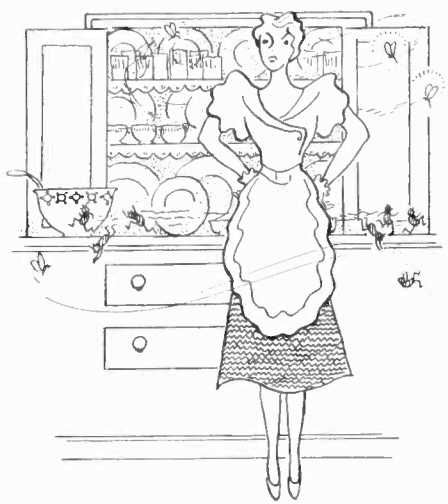
A tribe of mosquitoes is holding a flying circus in my kitchen, and the ants are using my cupboard for a warehouse.