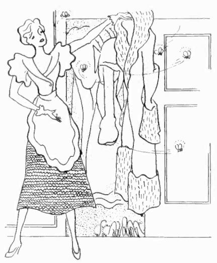
I'm at the end of my wits! Every moth in the neighborhood seems to think I'm running a free boarding house.