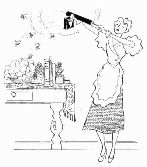
One Sniff and they're Stiff! Associated Fly Spray gets rid of the pests. It is stainless, odorless, more effective—costs less.

Buy Associated Fly Spray from your neighborhood grocer or Smiling Associated Dealer.