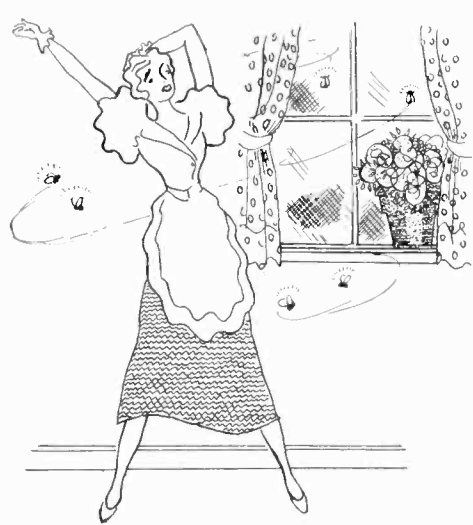
And flies don't seem to realize that I have screens on all the doors and windows to keep them from coming in. What to do?