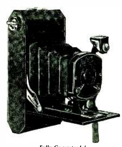
Fully Guaranteed for One Year