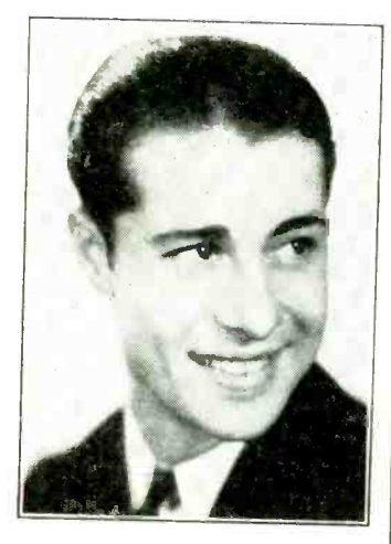
DON AMECHE NBC-Dramatic Artist