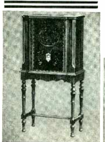
New SPARTON Model 420 Jewel