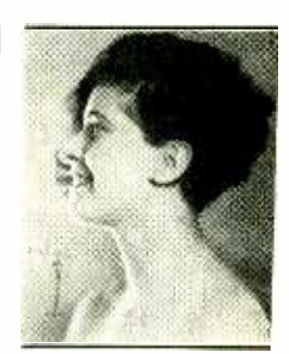
Gypsy KFRC-10 p.m.