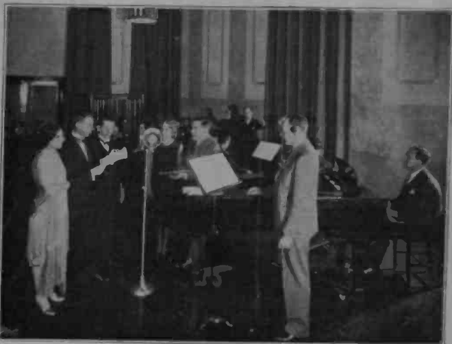
The "Evening in Paris" Group During An Actual Broadcast