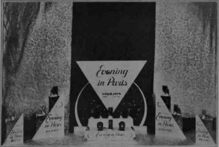
A Bourjois Window Display

position to tell the story of the broadcasting in connection with their regular calls.