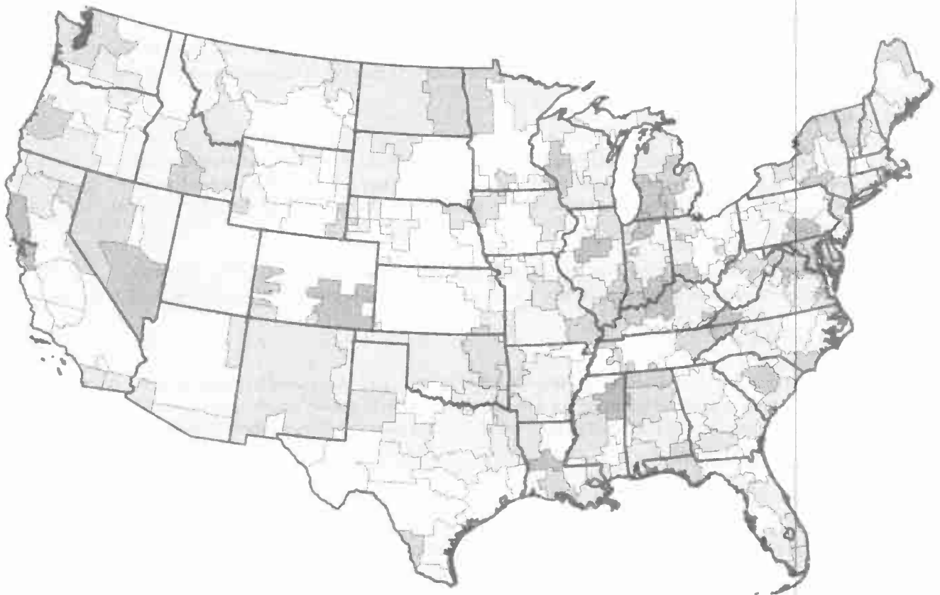
Figure 1. Designated Market Areas