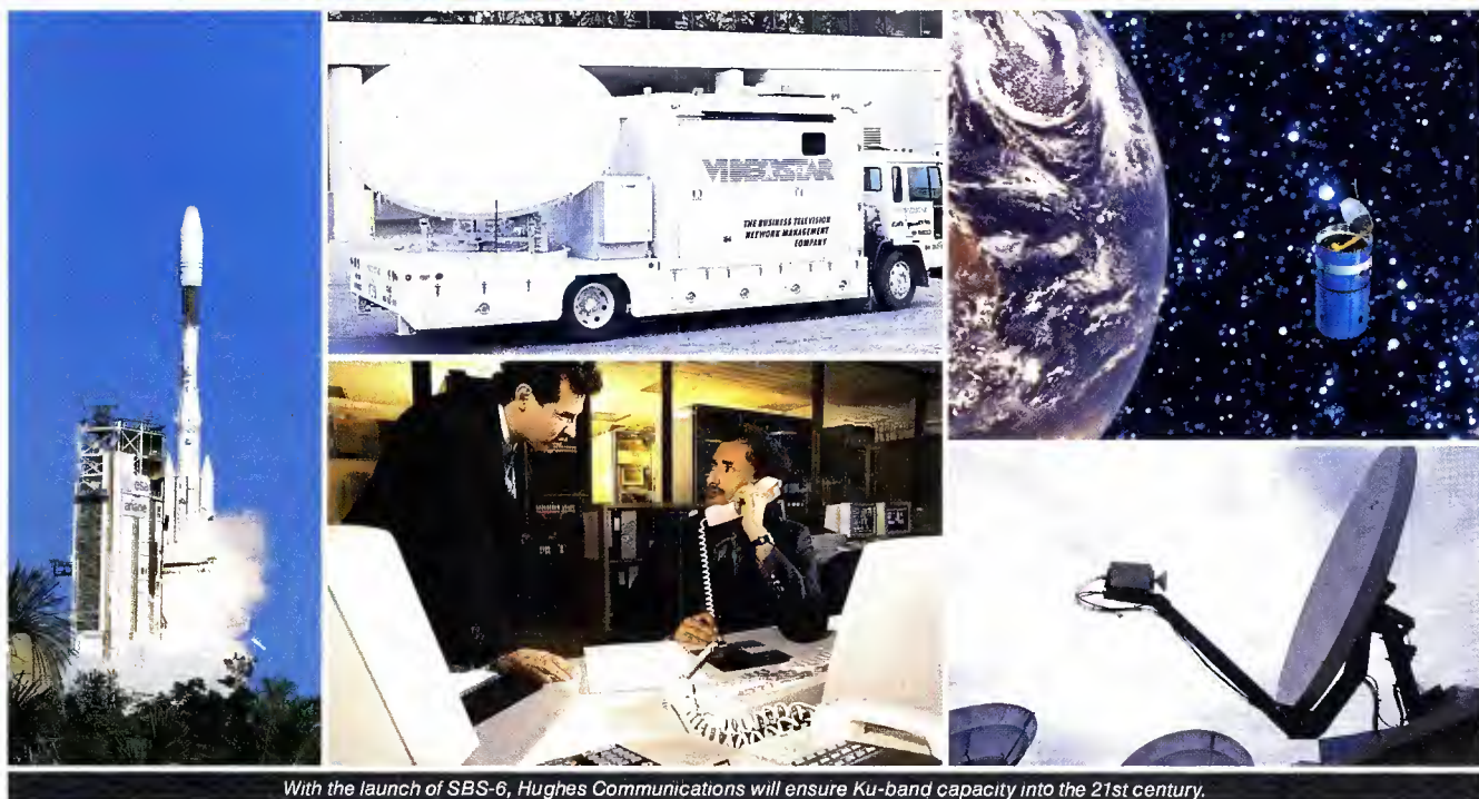
With the launch of SBS-6, Hughes Communications will ensure Ku-band capacity into the 21st century.

Hughes Communications means satellite service that's right for your business. No matter what you need. Or when you need it.