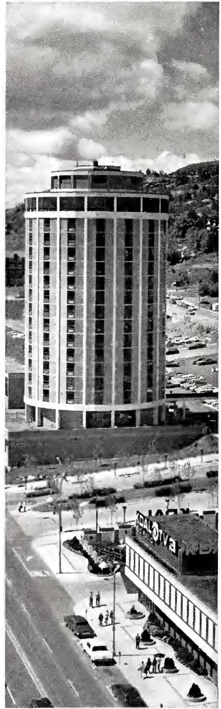
We're Duluth/Superior. KDAL-TV