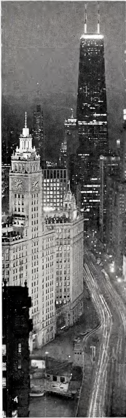
We're Chicago. WGN-TV