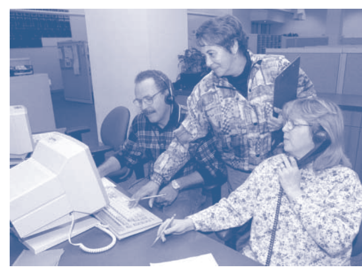
Arbitron's Interviewing Center places more than five million calls every year to randomly selected households.

The data are then released in book form as the Radio Market Report and digitally through Maximi$er® and Media Professional<sup>SM</sup>.