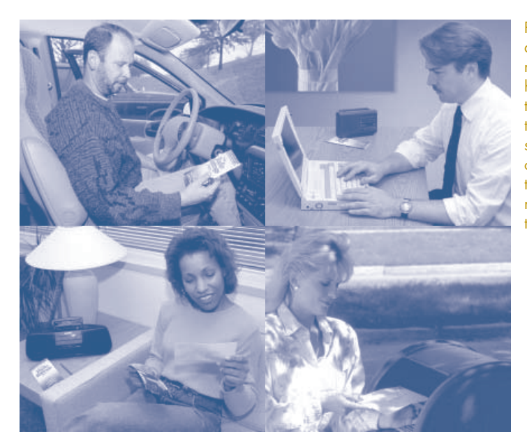
Participants are asked to record what radio station they heard and where they were when they heard the radio station. At the end of the survey week the participant mails the diary back to Arbitron.

This listening information is manually recorded by the survey participant on the appropriate "day page." An image of a diary day page is shown below.