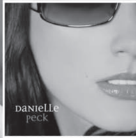
In-Stores This Week!

R&R: 27 +254 points BB: 30* +1.1 million impressions MOST AIRPLAY ADDS THIS WEEK!