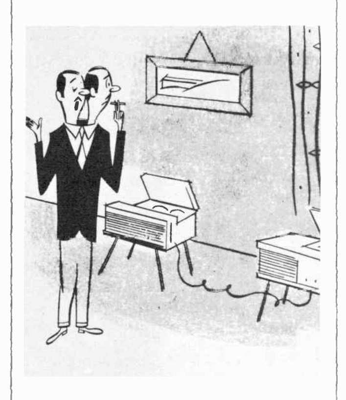
"I wouldn't have believed it if I hadn't heard it with our own ears."