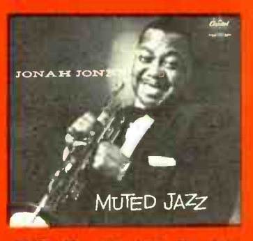
MUTER TATE - touch longs. The shall make the large about the lines to the same at the long transport is portunited in an allows that results all the con-