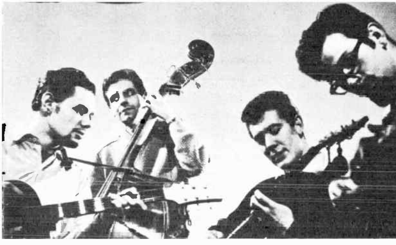
Success of English Skiffle Groups (story elsewhere in this issue) in this country has prompted new release by Capitol of The Vipers Skiffle Group performing "Cumberland Gap" and "Maggie May." The Song Cumberland Gap" is one of England's top tunes and is now "breaking" in U.S.