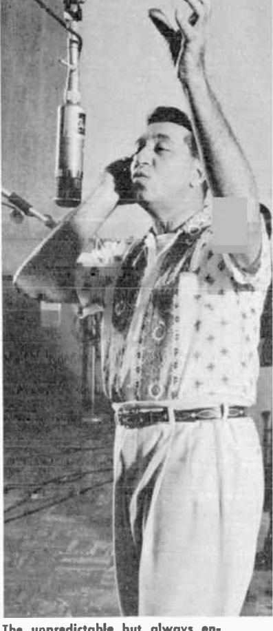
The unpredictable but always entertaining Louis Prima has a driving new package being presented under title "Call of the Wildest."