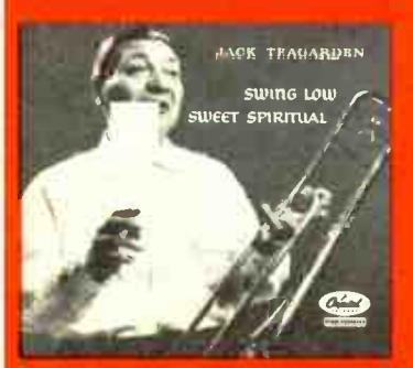
Swifts Low Emili Spiritual lack regarder. The province involved and before a skill provided a lack to be a skill provided lack Eschel' Shedred and other pro-