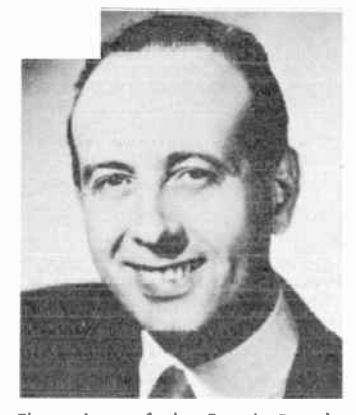
The strings of the French Franck Pourcel are featured again in a new Capital of the World album known as "Honeymoon In Paris."

In addition to the musical inscription, the late band-The structure will be installed