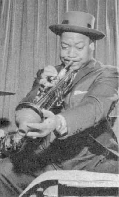
"Muted Jazz" is the descriptive title of new album by Jonah Janes.