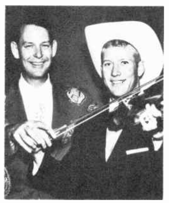
It probably isn't part of spring training but Mickey Mantle swung a mean bow during recent appearance on Leon McAuliffe's TV show in Tulsa, Oklahoma, prior to additional appearances in Las Vegas.

The mass appeal of this type of material to both children and adults makes the choice of stories so desirable. Better yet, the stories are free.