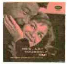
HEY LET YOURSELF GO!-Nelson Riddle T 814