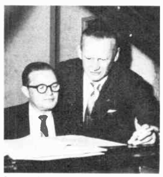
Sammy Kaye peers over shoulder of tunesmith Jule Styne during recording of album of tunes from "Bells Are Ringing" made at dance tempo.