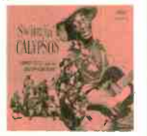
SWINGIN' CALYPSOS-Lord Flea T 842