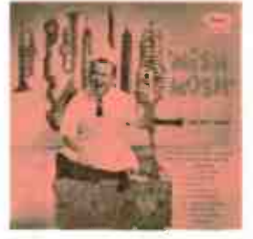
"MISH-MOSH"-Mickey Katz T 799