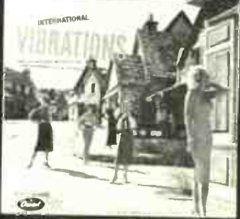
VIBRATIONS-Ray Maritin Musical miniatures depicting the sen-suous charms of the most lbeautiful girls in the world. Composed arranged and conducted by Ray Martin T 10056

Nostaigic ballads featuring rich strings and the mellow trumpet of Bobby Hackett. Styled by the master of roman-W 816 World Radio History tic music, Jackie Gleason.