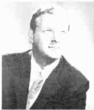
This is Les Baxter, whose Capitol disk, "Poor People of Paris" is still going strong. Coupled with it: "Theme From 'Helen of Troy'."