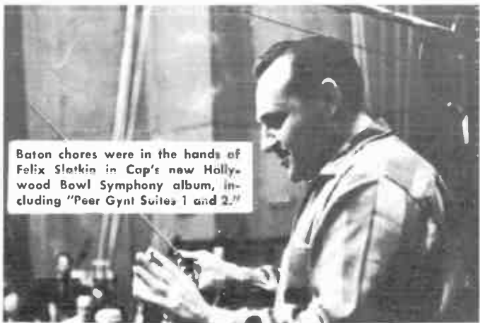
Baton chores were in the hands of Felix Slatkin in Cap's new Hollywood Bowl Symphony album, including "Peer Gynt Suites 1 and 2."