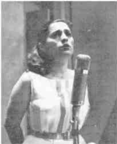
Joni James, the MGM Records gal, seems to be taking herself quite seriously as she gives her all at session of "My Believing Heart."