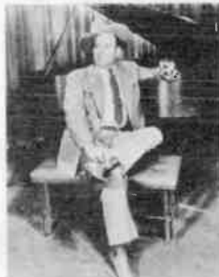
Complete with stogie, Stetson and Steinway is smiling Bob Wills. He does his platter making for MGM.