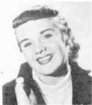
Molly Bee, featured singer with Tenn. Ernie Ford on his NBC-TV show Monday through Friday, has recently signed to record for Dot.