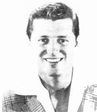
Capitol Records' Gordon MacRae has taken over Monday night spot on NBC-TV formerly occupied by Tony Martin. Show's aired weekly.