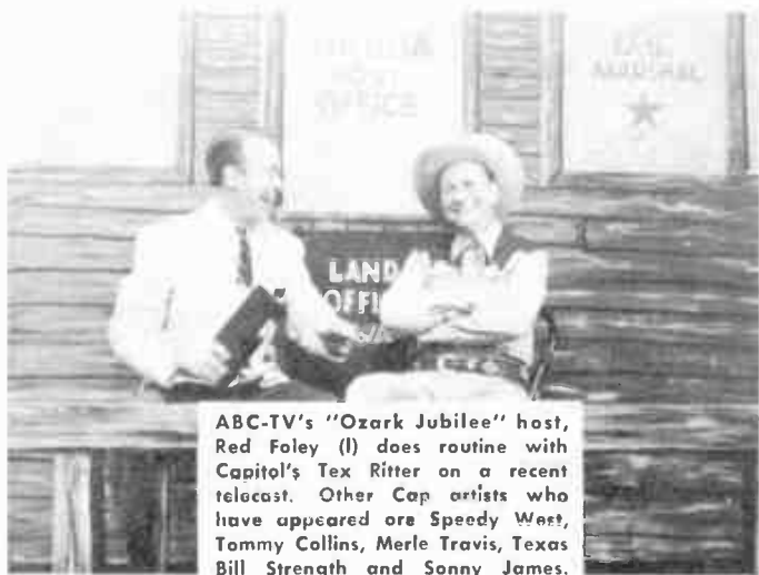
ABC-TV's "Ozark Jubilee" host, Red Foley (l) does routine with Capitol's Tex Ritter on a recent telecast. Other Cap artists who have appeared are Speedy West, Tommy Collins, Merle Travis, Texas Bill Strength and Sonny James.