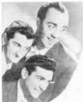
Newest of The Gaylords, Mercury records artists, is "Molly-O."