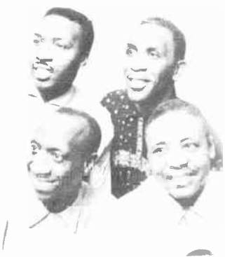
The Four Knights vocally assure "I Love You Still" in newest release from Capitol. Backside is familiar, "Happy Birthday, Baby."