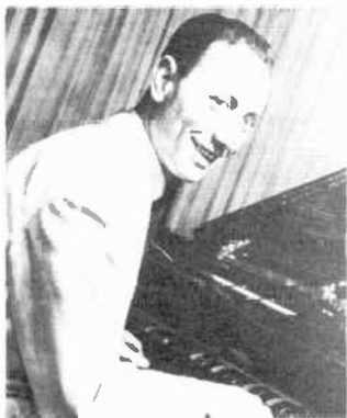
Renato Carosone, Italy's foremost pianist-vocalist, offers a hit from that country, "Infatuation" which is backed by fast "Lotta Piano."