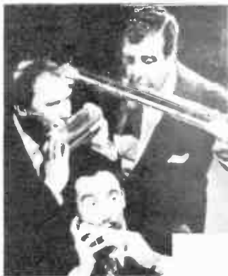
"You Tell Me Your Dream" is the current Harmonicats Mercury disk.