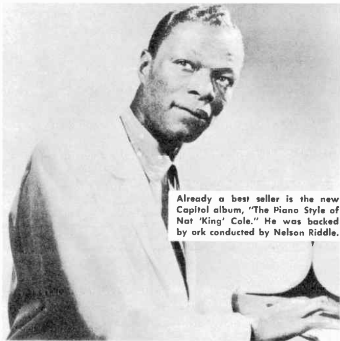
Already a best seller is the new Capitol album, "The Piano Style of Nat 'King' Cole." He was backed by ork conducted by Nelson Riddle.