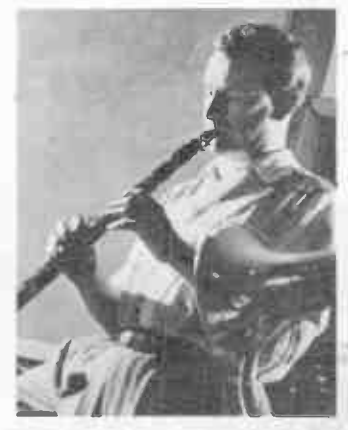
Composer-arranger-instrumentalist Jimmy Gluffre's new Cap album is called "Tangents In Jazz." It hit nation's stores this month.