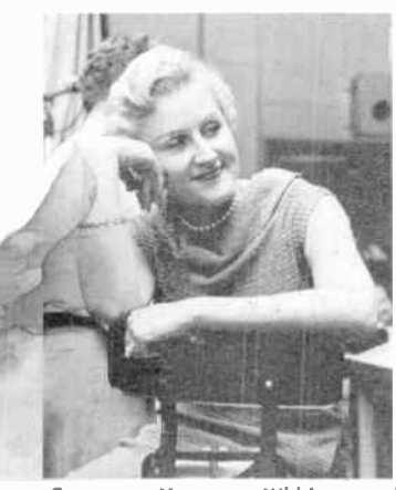
Cap star Margaret Whiting used "Those Whiting Girls" video show to launch her new Capitol disk "Lover, Lover (Never Leave Me)."