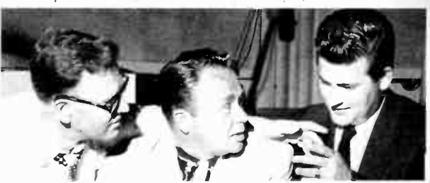
KEN NELSON Record producer

Born July 7 in Pasadena, California. Height: 5 feet, 8 inches. Weight: 180 pounds, Green eyes, Black hair.