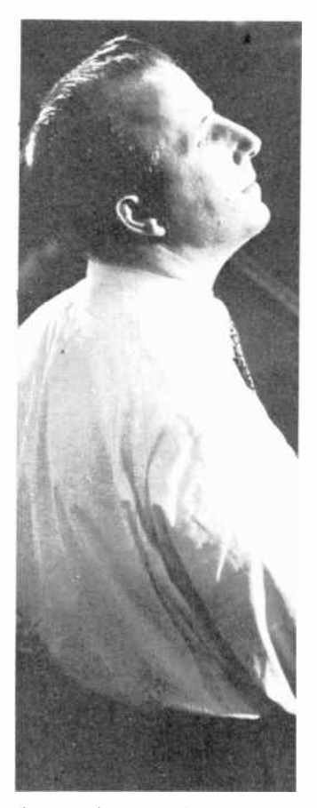
George Shearing's first packages for Capitol label, "The Shearing Spell," are out this month both as 33½ and 45 rpm albums.