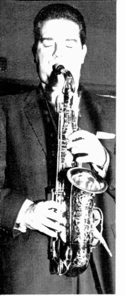
"Sounds and Songs" is name of new Capitol jazz album by Al Belletto (above) sextet. Stan Kenton discovered them in Chicago.