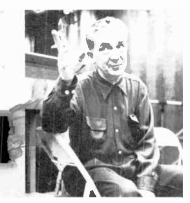
Red Nichols takes a "break" at Cap studios in Hollywood. His second Penny Symphony platter for label is "Viennese Lantern."