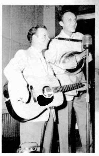
The smiling Louvin Brothers, on the Capitol label, have an unusual single out with the title "Just Rehearsing." Going great.