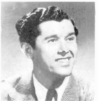
Three Roy Acuff songs that together have sold over 25 million are in his new Capital album, "Songs of the Smoky Mountains."