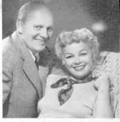
Pleasant listening is promised by the husband-wife team of June Hutton and Axel Stordahl in new Capitol album called "Afterglow."