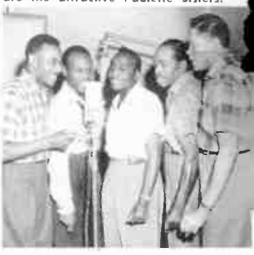
Making their debut an Cap label last month were The Cues. "Burn That Candle" was on the topside and "Oh My Darlin" on the back.