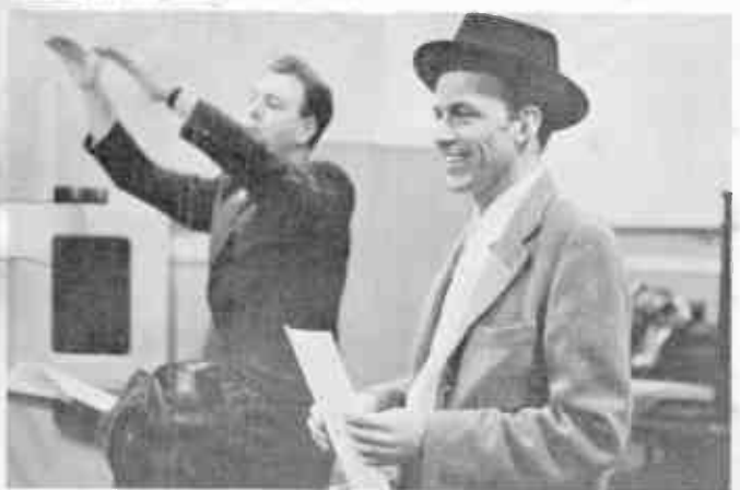
Last month Frank Sinatra appeared as singing star-narrator in TV's premiere musical presentation of Thornton Wilder's "Our Town." For Capitol he recorded four songs from the production for a 45 rpm album and two for a 78 rpm disk. Nelson Riddle accompanied. Artists above,