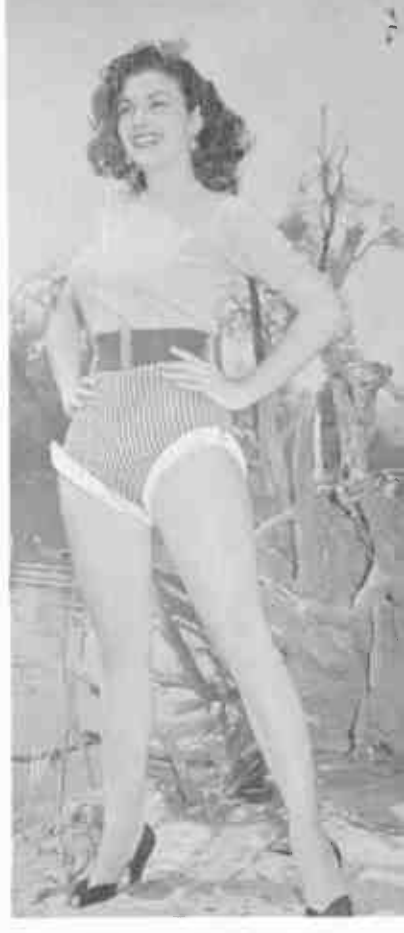
Mara Corday, one of Hollywood's most photographed models, is being groomed by Universal-International for musicals, starting with current pic, "Man Without a Star."

The big names mingled with the chorus lines as they all filed over to the Sands Hotel where the 3:00 A.M. showing was held. A party, hosted by the Sands' Jack Entratter, was given following the movie.