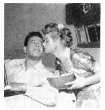
The life of a leader of a rhumba band was never like this! "Lucy" plants a wifely buss on the countenance of Desi in scene from new movie, "The Long, Long Trailer."

"When the records were made, he (the singer) took them around personally to the various New York disk jockeys, who, in turn,