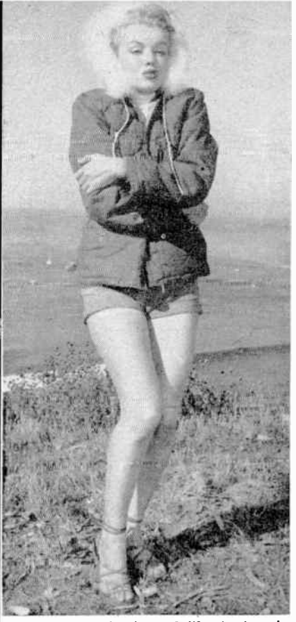
Even Southern California is subject to March winds, but M. M. is liable to weather the storm. She has her baseball player to keep her warm. Oh, to be a 300 hitter.