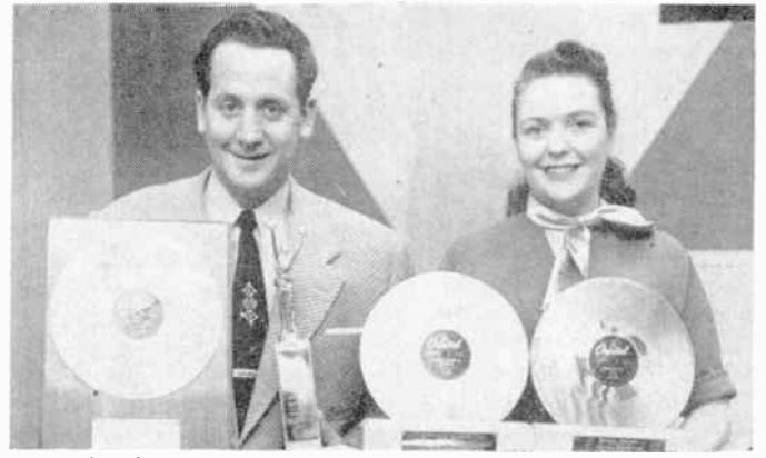
Les Paul and Mary Ford get happy—it ain't hard—over gold records won by hits "How High the Moon," "The World Is Waiting for the Sunrise" and "Vaya con Dios." Gold disks signify sales of 1,000,000—but "Vaya," having sold 2,000,000, won Les and Mary a second gold record just before Music Views went to press. Gold statuette is a Cash Box Magazine award.

★ Dealers with local 34.66 permit may use 1½c pre-cancelled stamp (or meter) on mailings of 200 or more; otherwise use 2c uncancelled stamp (or meter). Na envelope or sealing required. Mail at Post Office. When 2c stamp is used, place stamp so it covers up the words "Sec. 34.66 P.L. & R."