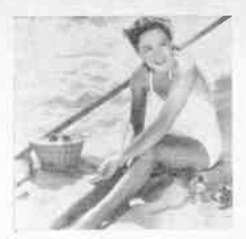
Patrice Munsel, Metropolitan Opera star, relaxes after the completion of her film starrer, "Melba." She cut the film score in album form for Victor, also "Melba's Waltz."