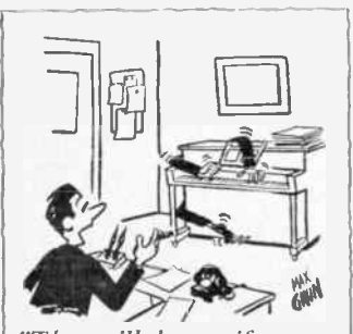
"That will be terrific on a record, but you'll have to overcome that shyness before you make a personal appearance tour."