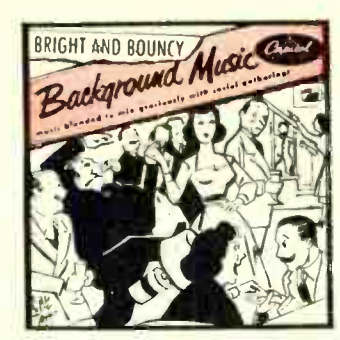
No. 377-331/3 or 45 rpm