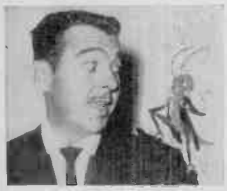
TENNESSEE ERNIE discusses odd cricket sounds heard on his ABC deejay show with an authority. ABC city engineers were confused by the unique call and suspected mechanical failure.