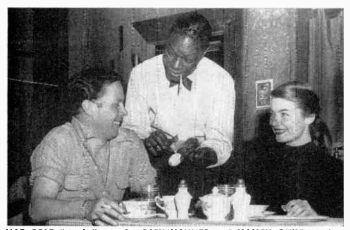
NAT COLE "cracks" one for DICK HAYMES and NANCY GUILD on Lux Video Theatre. It was Cole's debut as a tv actor. After the dramatic bit for CBS, Nat jumped into the Warner picture, "Blue Gardenia."