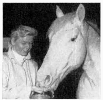
DORIS DAY does the oot bit for Silver who ploys a stroight dramatic role in Miss Day's forthcoming Warner musical, "Calomity Jone."