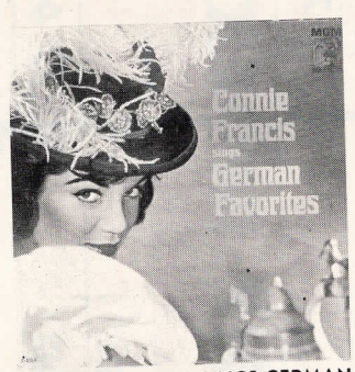
"CONNIE FRANCIS SINGS GERMAN FAVORITES" MGM SE 4124