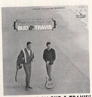
"PERSPECTIVE ON BUD & TRAVIS" LIBERTY LST 7341