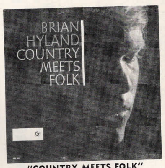
"COUNTRY MEETS FOLK" BRIAN HYLAND ABC PARAMOUNT ABC 463