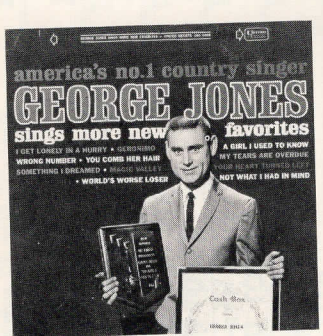
"AMERICA'S NO. 1 COUNTRY SINGER" GEORGE JONES UNITED ARTISTS UAS 6338