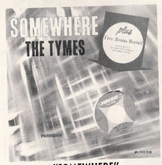
"SOMEWHERE" THE TYMES PARKWAY P-7039