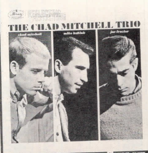
"REFLECTING" THE CHAD MITCHELL TRIO MERCURY MG 20891