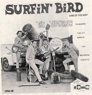
"SURFIN' BIRD" THE TRASHMEN GARRETT LPGA-200