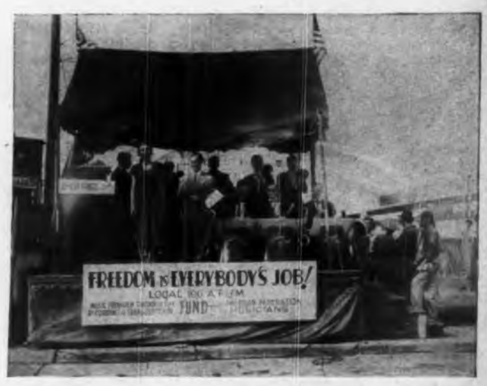
Cooperating with the Champaign-Urbana, Illinois, Citizens Committee, a band from Local 196 played continuous music during the arrival and stay of the Freedom Train—from 9:00 A. M. to 10:00 P. M. The sign clearly gave the credit to the Recording and Transcription Fund.

OR ALMOST two years now the Federation's Recording and Transcription Fund has represented one of the world's most notable private philanthropies in point of annual spending. It has also reached a great many people in all parts of the North American continent. But even yet the program under the Fund is not as well known as it deserves to be.