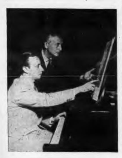
MORTON GOULD and VLADIMIR GOLSCHMANN

MORTON GOULD'S "Symphony on Marching Tunes", when it was re-cently given its premiere performance by the New York Philharmonic-Symphony Orchestra, under the baton of Vladimir Golschmann, was acclaimed by critics and