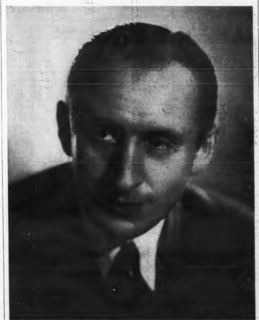
VLADIMIR HOROWITZ, Eminent Planist