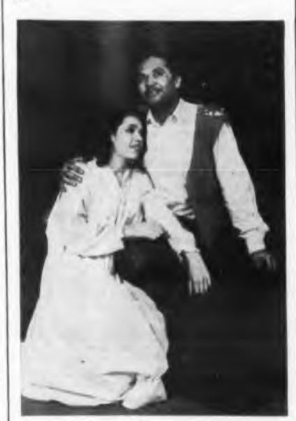
ANNE BROWN and TODD DUNCAN In "Porgy and Bess"

PALE press notices about "Rose Burke" PALE press notices about "Rose Burke" were offset by drawing power of lead Katharine Cornell, and the play rolled up a most satisfactory $12,500 in four performances the week ending March 7th. Two weeks later "Panama Hattie" in eight performances swept $22,000 in the