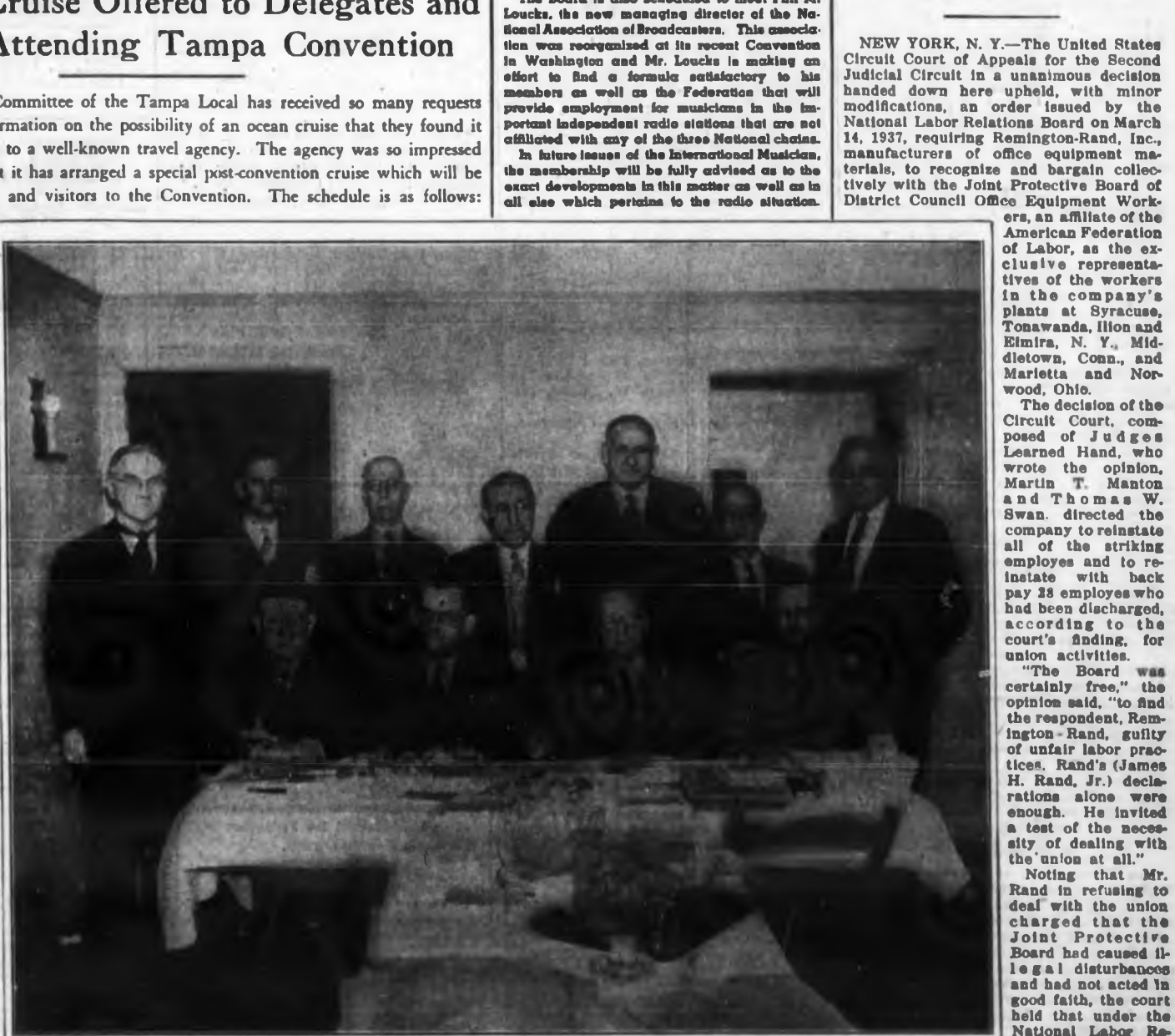
THE INTERNATIONAL EXECUTIVE BOARD AT WORK

The court made a modification in the board's order regarding the section requiring Remington-Rand to withdraw all recognition of "the lilon and Middletown company unions" and to diseatablish