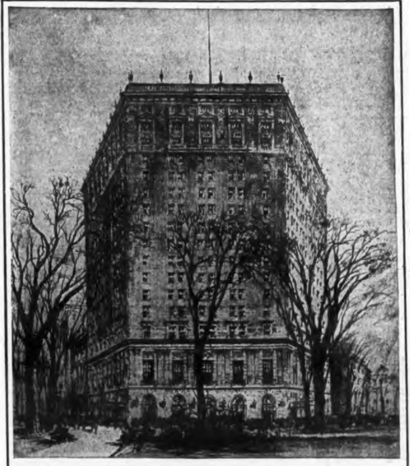
HOTEL STATLER, DETROIT, has been selected as Official Headquarters for the 41st Annual Convention of the American Federation of Musicians. Among the many outstanding institutions in Detroit is Hotel Statler, one of the fine units in the world-famous Hotels Statler group. Facing Grand Circus Park, with entrances on Washington Boulevard and Bagley Avenue, the Statler is within a stone's throw of practically all important buildings, shops and theatres in Detroit. Because of the hub arrangement of streets in Detroit, all principal arteries of traffictenverge at Grand Circus Park. All railroad stations and lake steamer wharfs are within a few minutes' ride of Hotel Statler. With its 1,000 rooms and baths, and its complete function space, Hotel Statler affords unsurpassed accommodations for individual guests and convention groups. Statler service and equipment features, for which one pays no more, contribute toward the economy of your visit. The American cookery in a variety of Statler restaurants will delight you at such moderate prices.

ceive highest wages here. Detroit awaits you and you will find Detroit a hospitable city—a city that is not 200 large and yet so deversified that it will appeal to all.