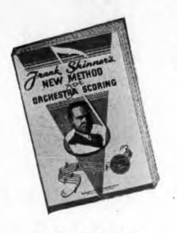
PRICE $2.00 NET