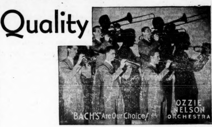
BRASS SECTION, OZZIE NELSON ORCHESTRA, 100% BACH (Hotel Lexington, New York)

This superb'dance orchestra has reached the front ranks of recognition, for its unusually fine performances, tonal effects and technical execution command the admiration of every student of modern music.