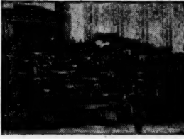
The Deagan 100-piece World's Fair Marimba Band introduces a new chapter into the progress of percussions. In the opinion of many, it marks the beginning of a definite trend toward marimba bands and ensembles.

... and until you have seen a copy of the new Deagan Catalog "A" you will have no idea of the strides that have been made in marimbas, xylophones, etc. Address request to